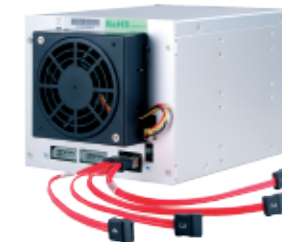
NS160S + miniSAS to 4*SATA cable