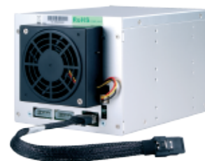
NS160S + miniSAS to miniSAS cable