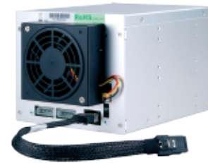
NS160S + miniSAS to miniSAS cable