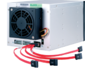
NS160S + miniSAS to 4*SATA cable